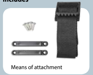
Means of attachment