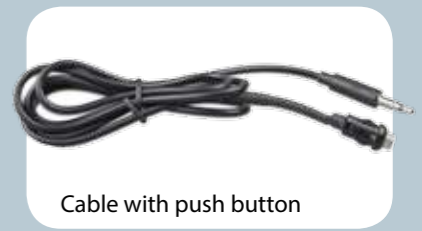
Cable with push button