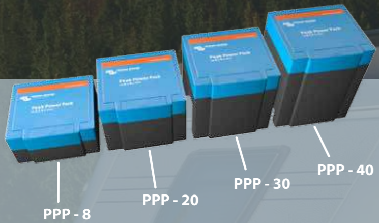
PPP - 8 PPP - 20 PPP - 30 PPP - 40